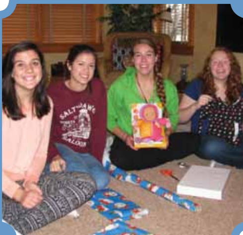
Above: MACS Adopt a Family 2013