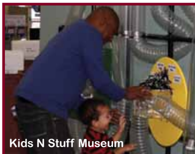
Kids N Stuff Museum