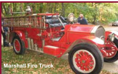
Marshall Fire Truck