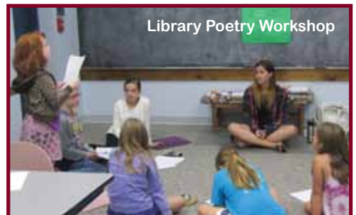
Library Poetry Workshop