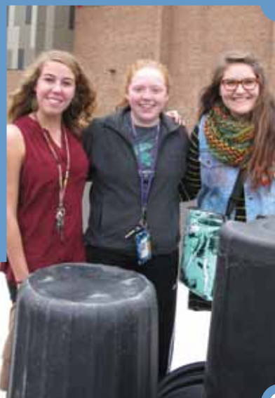
At Right: Ongoing YAC recycling project at Marshall Public Schools

From its inception in 1992, MCF's Youth Advisory Council (YAC) has strived to improve the community. Each year, up to 30 students from Marshall High School and the Marshall Academy learn the importance of philanthropy. The group is committed to community service projects and achieves this through grantmaking and volunteer activities.