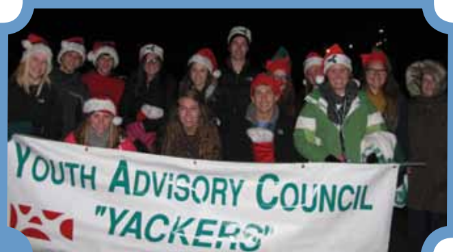
At Right: YAC in Marshall Christmas Parade 2013